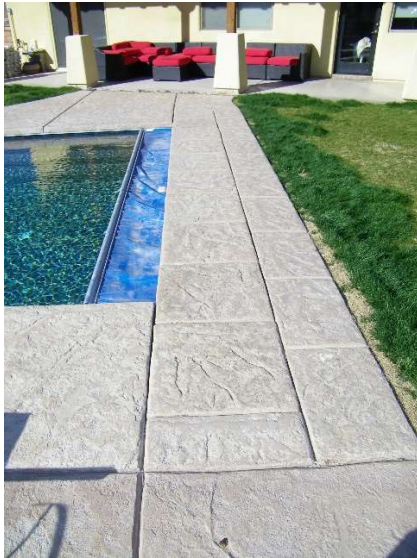
Not fully retracted

Front edge of pool cover retracts under the extended vanishing lid. Majority of pools tiled lowerd beam is concealed. May be designed with or without trays under pavers. Requires specific clearances when preparing the poolsite. Preferred application is 1 stone per lid tray.